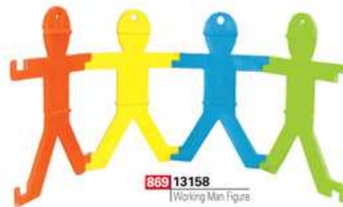
869 13158 Working Man Figures