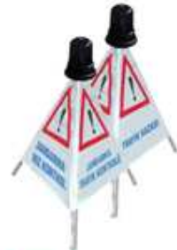
869 13271 Triangle Reflector with Floodlight