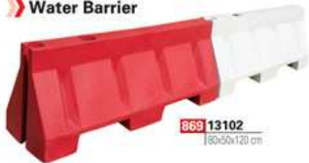
869 13102 80x50x120 cm