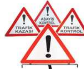
869 13270 Caution Sign