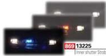
869 13225 Inner shutter Strobe Beacon System