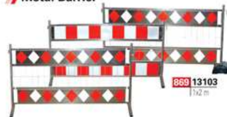
869 13103 1x2 m