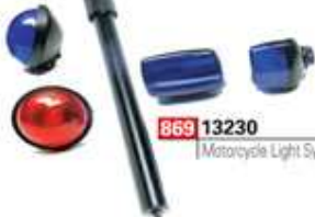
869 13230 Motorcycle Light System