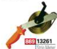
869 13261 Strip Meter