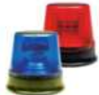
869 13220 Cylinder Top Lamp