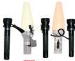
869 13202 Trafficler Lighthouse Set