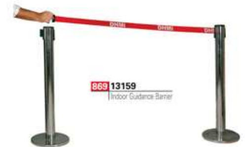
869 13159 Indoor Guidance Barrier