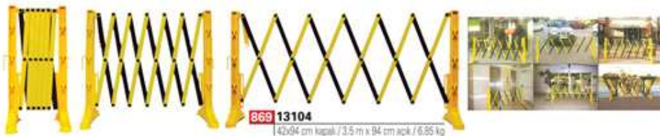
869 13104 40x94 cm kapak / 3.5 m x 94 cm ağı / 6.95 kg