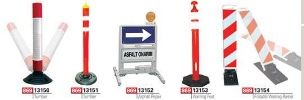
869 13150 Tumbler