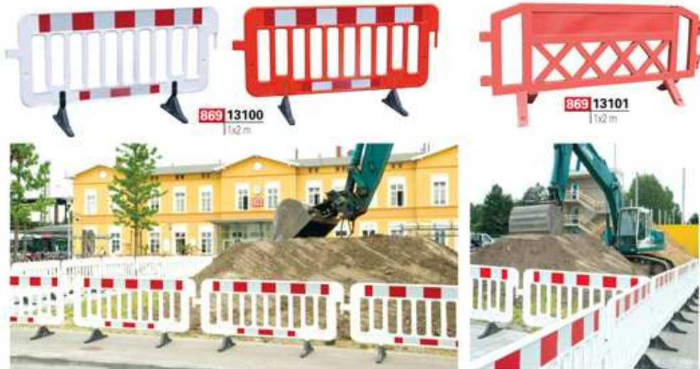
869 13100 1x2 m