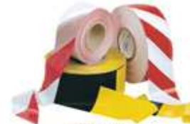
869 13262 Security Strip (500 ml)