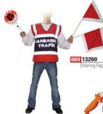
869 13260 Warning Flag