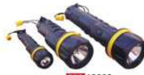
869 13203 Battery Pocket Lamp