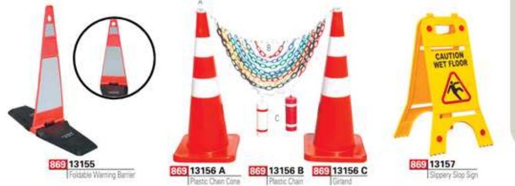
869 13155 Foldable Warning Barrier