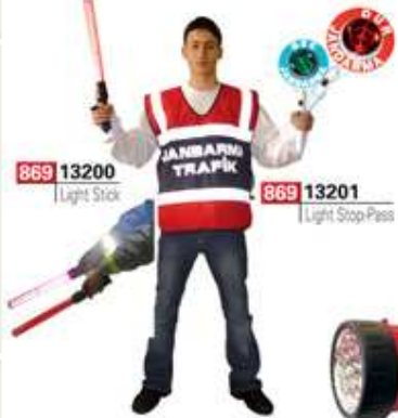
869 13200 Light Stick